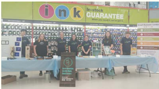
2019 Summer Company