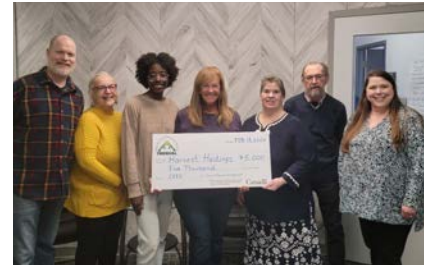
Harvest Hastings $5,000