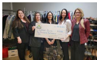
Youth Habilitation Quinte Inc. $4,500