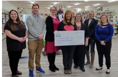
Deseronto Public Library $7,500