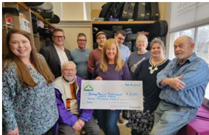
Stirling Musical Instrument Lending Library $7,000