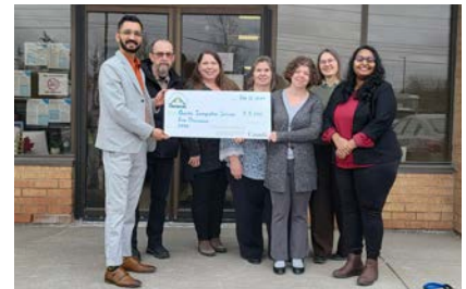
Quinte Immigration Services $5,000