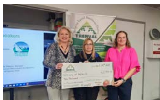
City of Belleville – Physician Recruitment $10,000