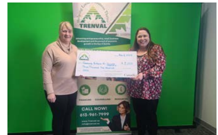
Community Partners For Success Cooperative Quinte Inc. $3,200