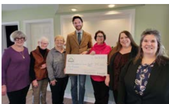
The Ladies of Sacred Heart $5,000