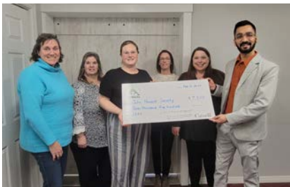
John Howard Society Belleville $7,500