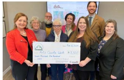
Arts Quinte West $7,500