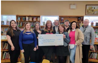
Tyendinaga Township Public Library $3,800