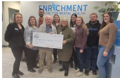
Enrichment Centre for Mental Health $4,000